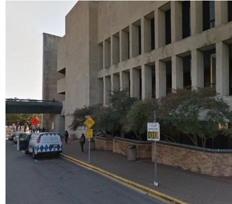
Entrance into UTC; view from 21 st Street

When and Where is Check-Out? Check out is at the UTC. Your student's luggage will be at the UTC; do not park at The Castilian on Sunday. After Closing Ceremonies concludes at 3:00 PM, your student will be able to check out from the University Teaching Center (UTC) at 105 E 21 ST ST, Austin, TX 78705. (Also try 105 W 21 st St. Austin, TX 78705 if searching on iPhone). You may also choose to stay for an optional reception taking place at the same time. If you have someone picking your student up, they can find street parking around the UTC, drive up to the UTC and pick-up, or park in the Dobie Parking Garage at 2005 Whitis Ave, Austin, TX 78705 and walk to the UTC. There is a fee to park in the Dobie Garage approximately $15. See graphic below for parking at the Dobie Garage and walking to the UTC.